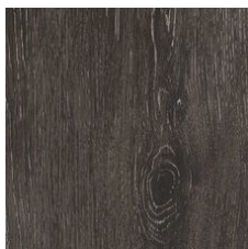
Prescott Oak 00708 LRV 16.9 V4 - Substantial Variation