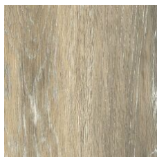
Willamette Oak 00707 LRV 31.6 V4 - Substantial Variation