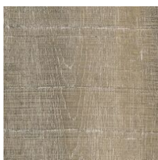
Monterey Oak 00211 LRV 23.4 V2 - Slight Variation