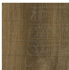
Gifford Oak 00703 LRV 11 V3 - Moderate Variation