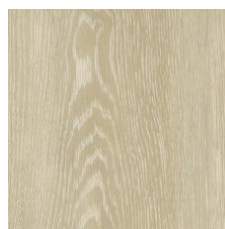
Inyo Oak 00705 LRV 42.3 V3 - Moderate Variation