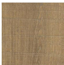
Hoosier Oak 00704 LRV 15.4 V2 - Slight Variation