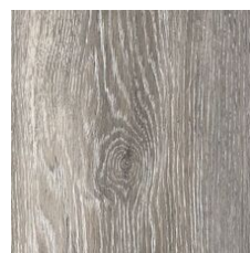
Sawtooth Oak 00706 LRV 16.5 V4 - Substantial Variation